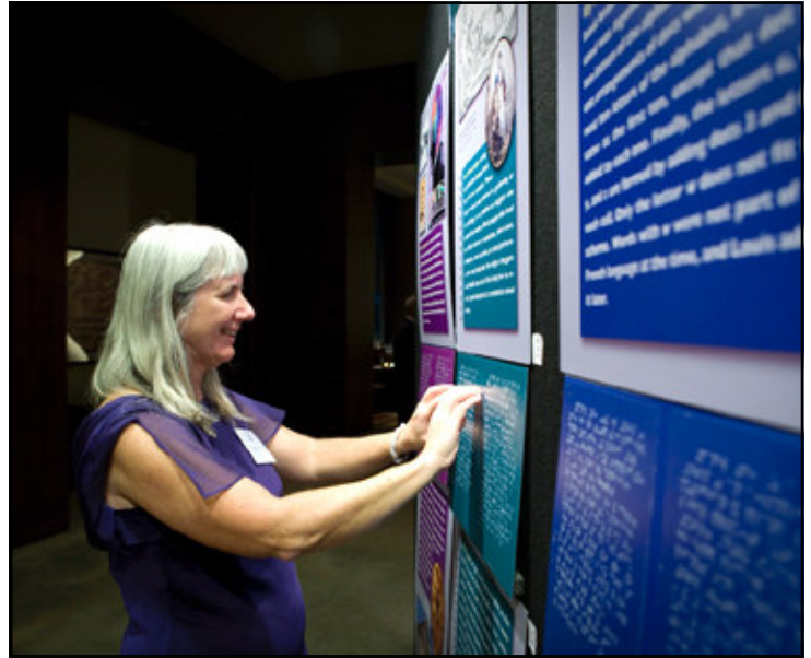
A visually impaired visitor reads the Brailled version of the exhibit.

Did you know Harry Potter weighs 12 pounds in Braille? The National Braille Press has produced a 20-panel traveling display, in print and Braille, that takes a viewer through the highlights of Louis Braille's life, the Braille production process, and why Braille remains important today. The Louis Braille Bicentennial Traveling Exhibit is booked in cities across the country, including Middleton Library at Louisiana State University from June 15 – July 12, 2009.