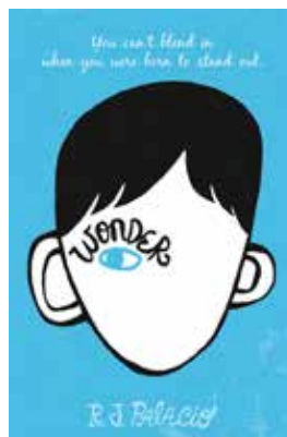
WINNER GRADES 3-5 Wonder by R.J. Palacio